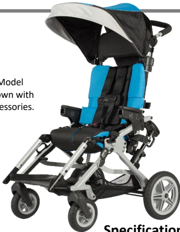
Model shown with accessories.