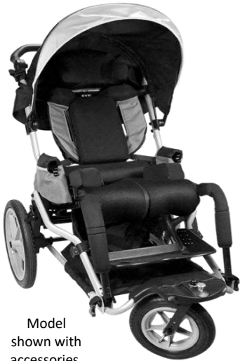
Model shown with accessories.