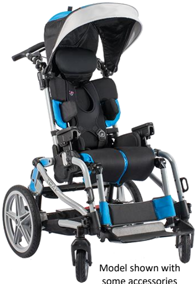
Model shown with some accessories